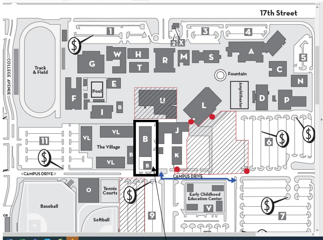
MCHS Operational Area