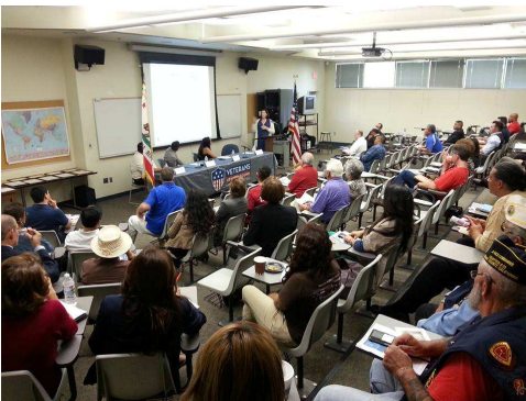
Veterans, families and community partners in attendance listen in on the most current issues affecting veterans and their benefits.