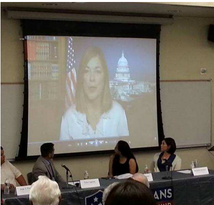
Congresswoman Loretta Sanchez addressed the forum via video feed.