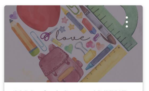
SAC Academic Senate - ADJUNCT... SAC Academic Senate - ADJU...