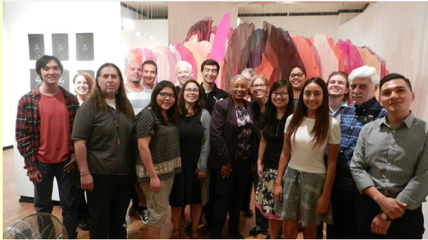
The Magic of Poetry poets and readers