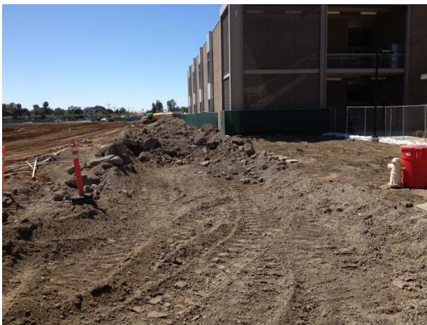
Base material removal at North Fire Lane