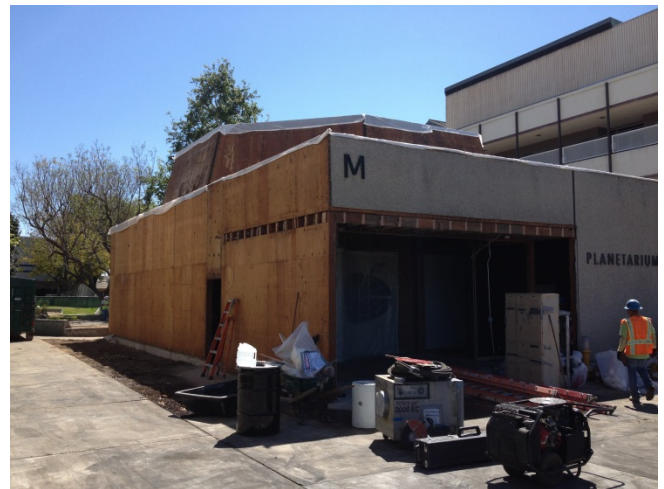
Asbestos Abatement & Interior Demolition