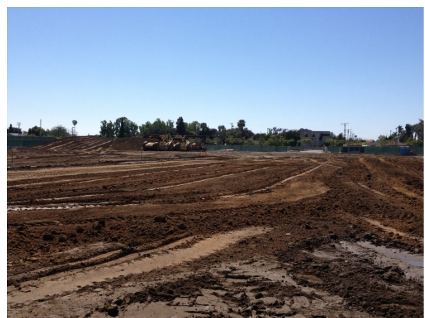
Rough grading operations at Parking Lot 11