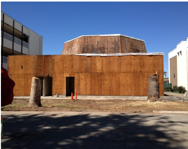
Asbestos Abatement/Demolition & Tree Removal