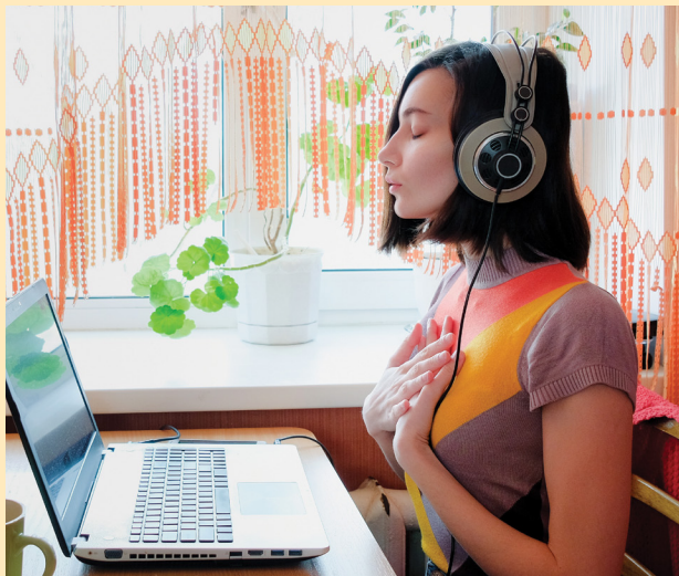
Earn a Certificate in MEDITATION