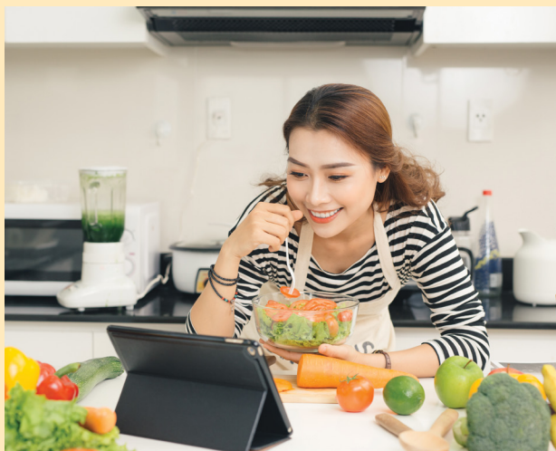
Learn to Create LOW-FAT LIGHT QUICK MEALS