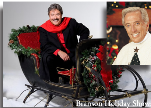
Branson Holiday Shows

There's no better time to embark on a journey to discover the best of Missouri and the Ozark Mountains. While the six spectacular productions in Branson will be featuring their holiday revues they will also have a patriotic tone to them as Veterans Day approaches. Along this journey you'll discover why St. Louis became the Gateway to the West, why Branson is the "Music Capital of the World," and why Eureka Springs and Kansas City have become world-renowned for their cultural and architectural significance.