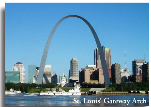
St. Louis' Gateway Arch

An included breakfast this morning before we're joined by a local guide for a panoramic tour of St. Louis. Visit The Gateway Arch Riverfront highlighted by the majestic Gateway Arch . At 630 feet, our nation's tallest man-made monument is more than just a structure. Take the optional tram