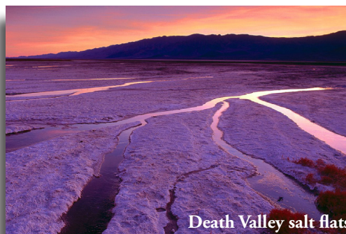
Death Valley salt flats