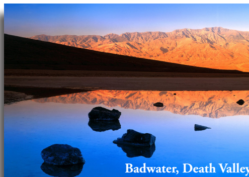
Badwater, Death Valley

Ever since the first immigrants saw Death Valley, fantastic tales have been told of its incredible temperatures and enormous riches. But exaggeration is inevitable in describing this narrow valley of strange, exciting beauty, cradled between towering, multi-colored mountains. Now comes your opportunity to enjoy the inviting and alluring Valley that so many before have visited. To walk on it's soil, to gaze upon its eclectic geological formations, to relax under its horizon. Welcome to Death Valley.