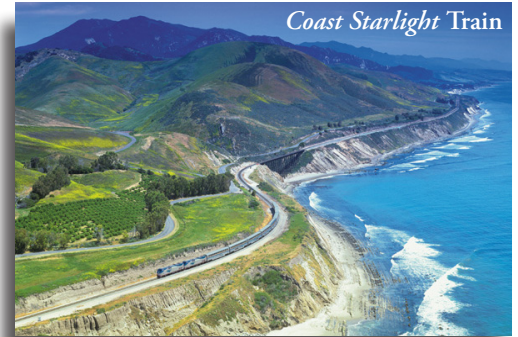
Coast Starlight Train

This morning we set out from our departure points for the tranquility of Cambria and California's Central Coast. We'll travel by motorcoach to Oxnard to board Amtrak's Coast Starlight . Here begins our train adventure as you leave your luggage on the motorcoach and board the train for a beautiful ride along the long stretch of coastline not visible from the highway. You are free to move around the train, get lunch from the snack bar or sit in the dining car. Check out the view from the sightseeing dome viewing car or just relax in your assigned seat. Upon our arrival in San Luis Obispo, our coach will be waiting to take us the rest of the way to the quaint seaside village of Cambria . Cambria is an artist's colony nestled in a forest of towering Monterey Pines. Cambria has a leisurely pace and country village atmosphere reminiscent of a small town. We will spend the next two nights at a quaint thatched-roof inn (with fireplaces in every room) that is located on a spectacular stretch of rugged coastline and just steps away from Moonstone Beach , offering an extraordinary array of tide pools and walk-able boardwalks. This evening, meet your fellow travelers at an included dinner at a local favorite. (Dinner)