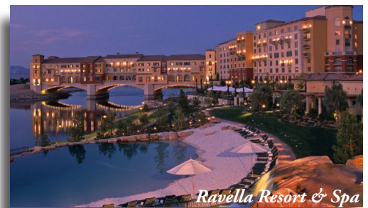
Ravella Resort & Spa

Following an included breakfast at the resort we head to Nellis Air Force Base and honor our Veterans this Veteran's Day weekend at the Nellis Air Show . The event is not open to the general public on Friday and the crowds will be minimal. The Air Force Thunderbirds are