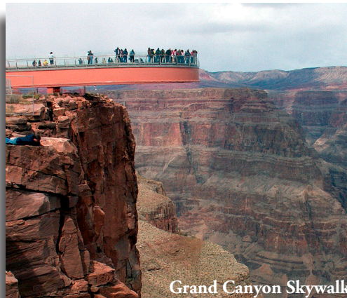
Grand Canyon Skywalk