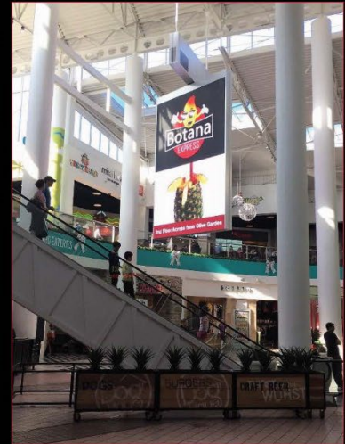
One of SAC's ads at Main Place Mall will be here!

*Multilingual (English, Spanish, Vietnamese)