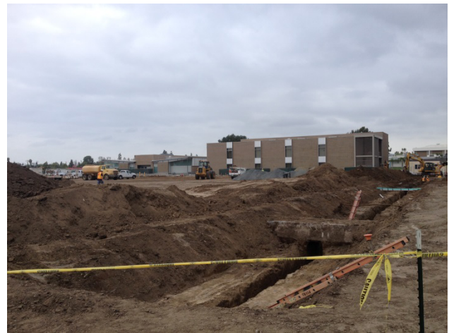
Grading and underground utility operations at Parking Lot #11.