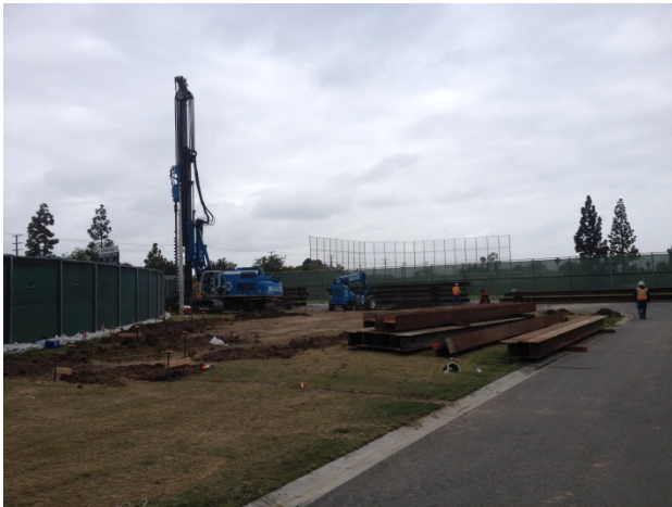
Drilling rig performing shoring operations between ball fields and tennis courts.