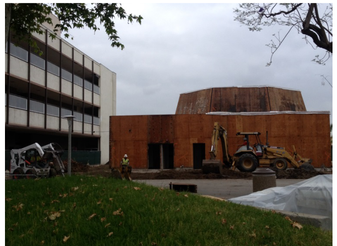
Hardscape Removal and Rough Grading Operations