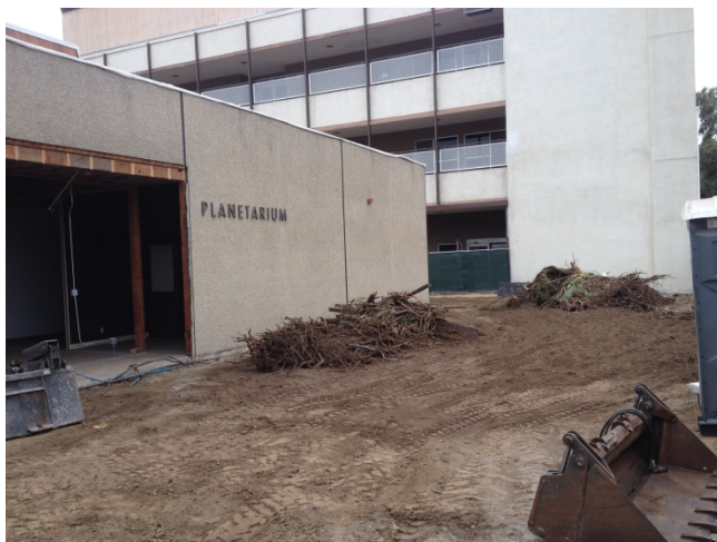
Hardscape Removal and Rough Grading Operations