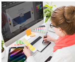
Digital Publishing and Adobe Applications for Business