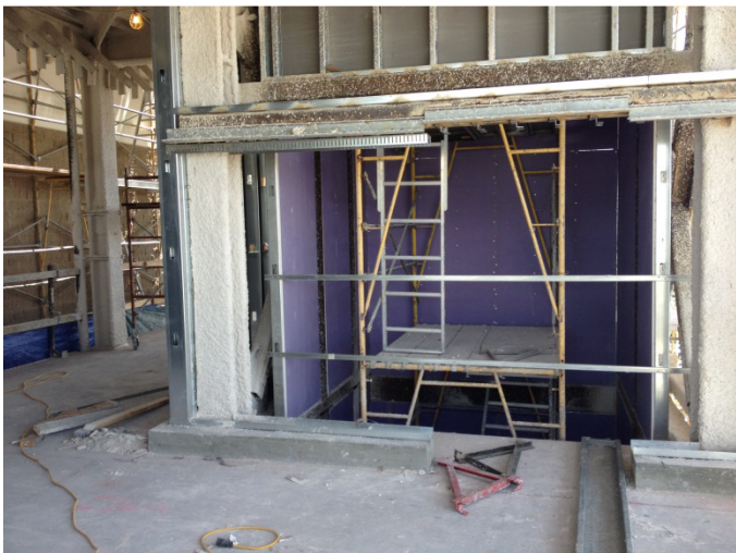
Drywall being installed in elevator shafts.