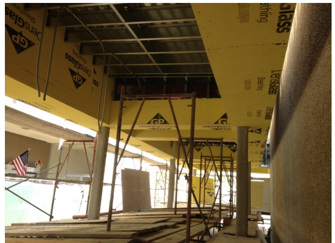
Dens board install at covered walkway ongoing.