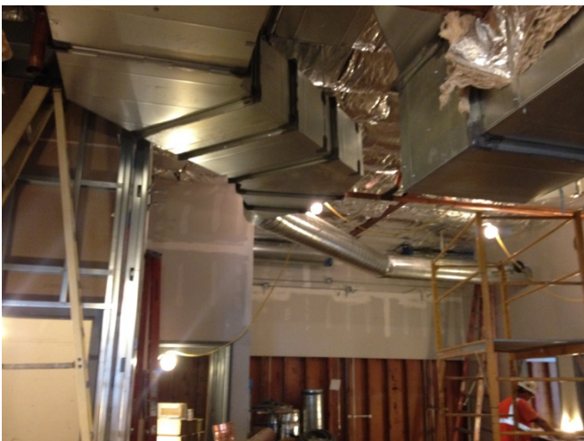
HVAC ductwork installation ongoing.